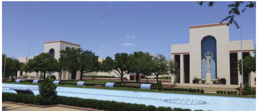
Centennial Hall Facade